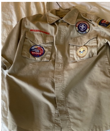
Tan uniform worn by Webelos (4 th & 5 th grade + adults)

Official shorts and belts are not required, but are nice to have. It's worth it for the photographs. See www.scoutshop.org for current prices.