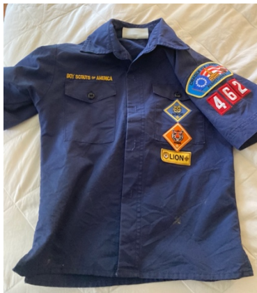
Blue uniform worn by Lions through Bears (from K-3 rd )

RECOMMENDED Class A uniforms: Both scouts and adult leaders should purchase an official uniform from the Valley Forge Scout shop with accompanying emblems and starter patches (Cradle of Liberty Council and Pack 462 on sleeves, along with your Den number). Ideally to be worn with blue or khaki shorts not gym shorts. The cost may vary. Expect at least $55 for youth and adults. Uniforms may also be purchased at your local Scout shop.